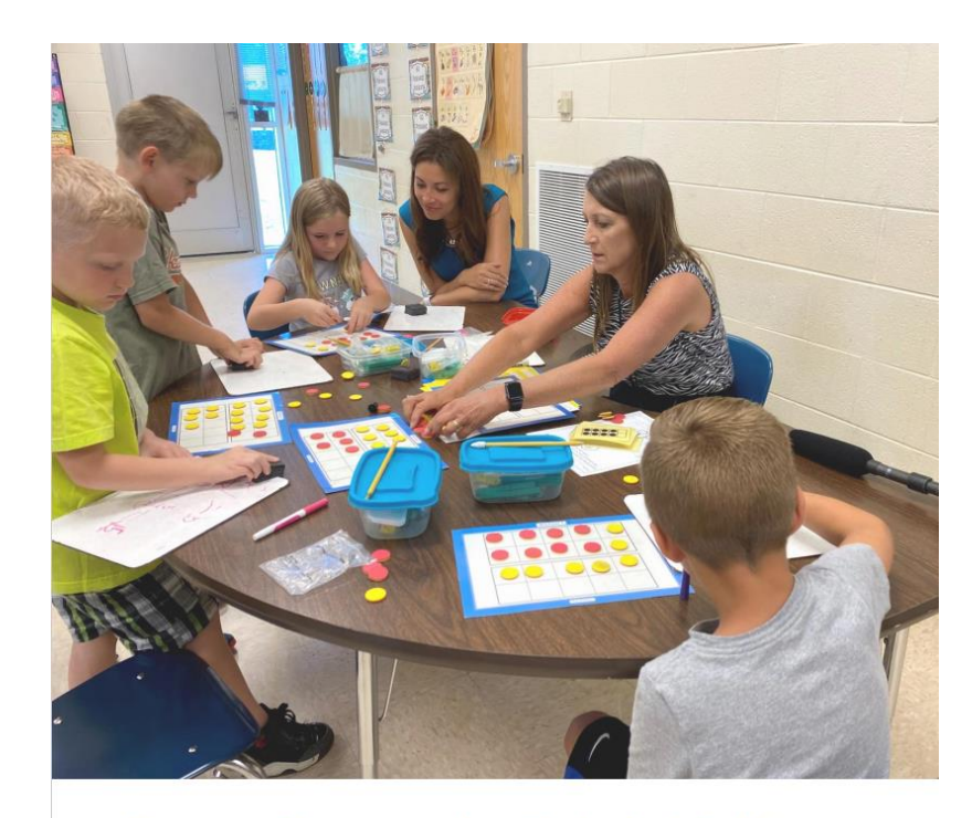
Summer Programming Technical Guidance Planning Toolkit - Summer 2022

2022_mastersummer_programming_guidance -FINAL.pdf (tn.gov)